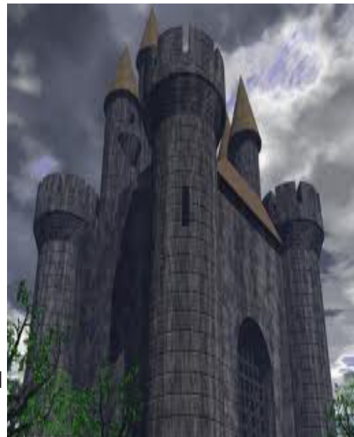
$24 million "Big Box Safe Room" as it would appear at East End Flats