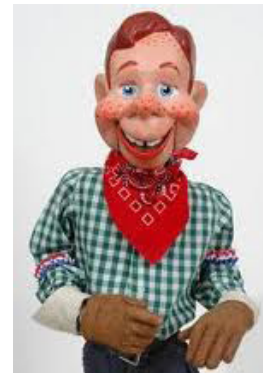
Howdy Doody Former Columnist

Reportedly, Kris P. Shankdit can be reached if your arms are long enough.