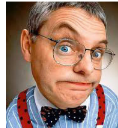
Peeper Tater old photo