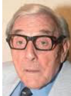
Dr. Nostril Damas

Those who fear they have developed a dependence on attending or watching Council meetings can attend a UTMB 12 step program. Remember watching City Council meetings is a proven gateway activity leading to watching C-Span.