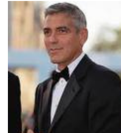
Peeper Tater new photo