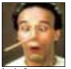
all the poop that's fit to scoop

From There to Here, Here To There - Funny Things Are Everywhere • Texas' Oddest Newspaper since 2010 • Vol. 1, No. 2 • "We Only Make Up The Truth"