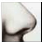
Sniffing out stories...