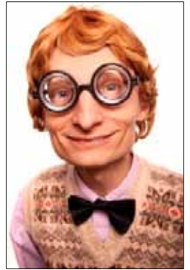
Peeper likes folksy stories Daily Noise Editor

"Genius is a term mistakenly applied to a master of vagueness." B. Wilder