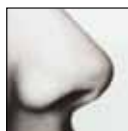
Sniffing out stories...