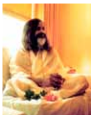
Groucho Vlasic Weather Guru

Forecast: HAPPY NEW YEAR! It's a crapshoot, folks!