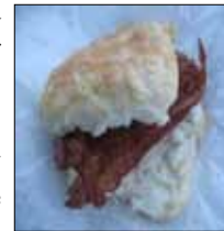
Gail Borden meat biscuit replica

Partners will have participants competing to see who can finish painting GHF properties and Artist Bloat kayaks first, using soy based lead-free paint in historically approved colors. Admission is $10 for adults, $25 for children. Contestant fee is $50. Please bring a canned ham or other canned goods to donate to the city's lunchtime austerity drive. Prizes will be awarded, including