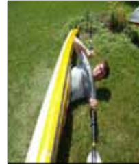
Eco Art and save the Vegetarian sustainableworld. The shows kayak safety event, called Paint pal