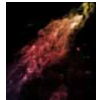
Yam shaped gas cloud

"It looked like Jabba the Hut," said Dewdrop. Others thought it resembled a large floating yam. Still another claimed it bore the likeness of former council-