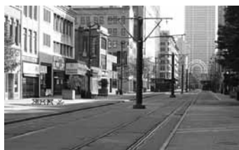
Downtown Galvatraz on a Friday

I dunno. It's not much of a Plan, and it will cost $20 gazillion bucks. It's the only one we have, but does that mean council should just take it and run with it? We better do something before downtown becomes skid row again, and